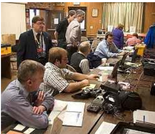
The ARES marshaling center in Chesterfield, Connecticut--just outside the TOPOFF 3 "hot zone."