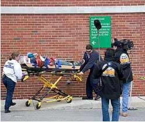
As simulated TV crews record the action, a TOPOFF 3 “victim” is transported to the hospital.