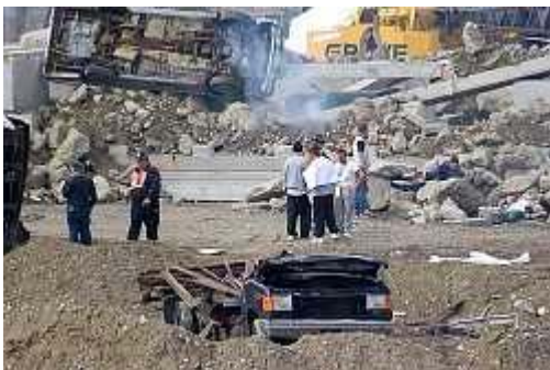
Realism was the order of the day at the TOPOFF 3 "ground zero" site in New London.