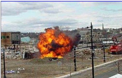
TOPOFF 3 started off with a bang in New London, Connecticut.