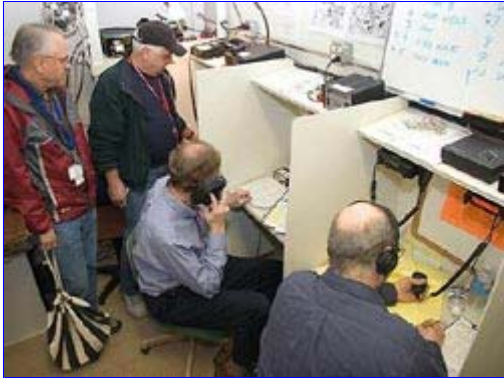
ARES volunteers staff a communications center at Red Cross Headquarters in New London.